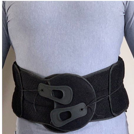
Step 6: Wrap the side wings right side overlapping the left side and pull the pull strings to your desired compression