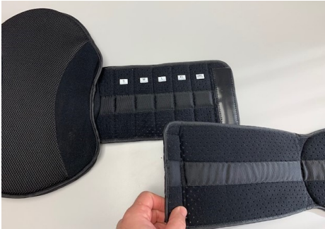
Step 2: On right and left side lift and detach the overlapping sizing extension