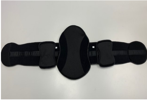
Step 1: Open brace and lay flat on a table