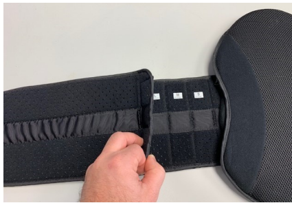
Step 4: Repeat step 5 to the opposite side so both sides are the same size. Reattach the lateral panel to both sides