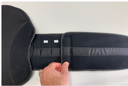
Step 3: Find your size (SM-3XL) and reattach the overlapping sizing system to the correct size