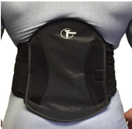
Step 5: Once properly sized center the back brace in the middle of your back (logo at the top) and wrap around your waist.