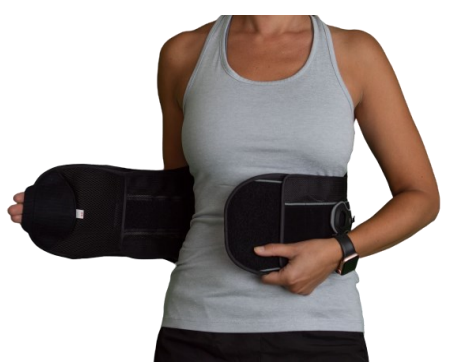
Step 6: Add higher front panel and center on abdomen Overlap right side wing and attach to left side wing for a