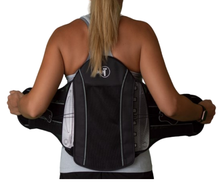
Step 5: Once sizing is completed. Reattach the lateral panels and center the back panel