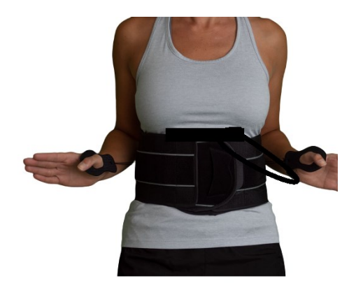
Step 7: Locate rubber pull tabs at the end of the right and left string and pull to desired support