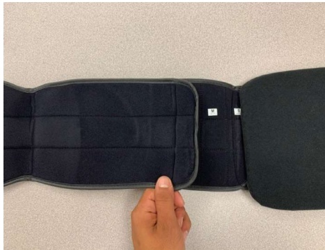
Step 4: Repeat step 5 to the opposite side so both sides are the same size. Reattach the lateral panel to both sides