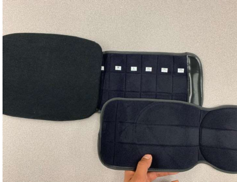
Step 2: On right and left side lift and detach the overlapping sizing extension