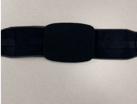
Step 1: Open brace and lay flat on a table