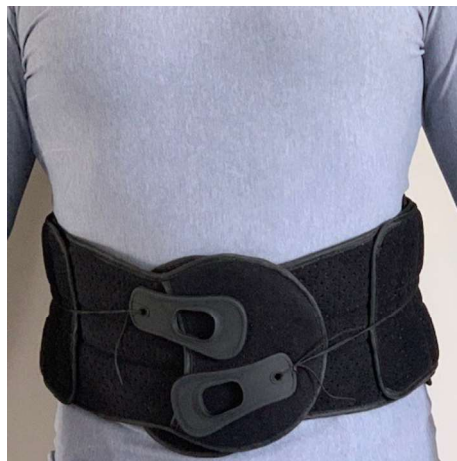
Step 6: Wrap the side wings right side overlapping the left side and pull the pull strings to your desired compression