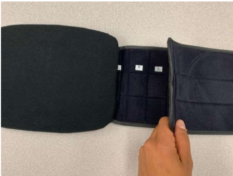
Step 3: Find your size (SM-3XL) and reattach the overlapping sizing system to the correct size