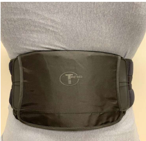
Step 5: Once properly sized center the back brace in the middle of your back (logo at the top) and wrap around your waist.